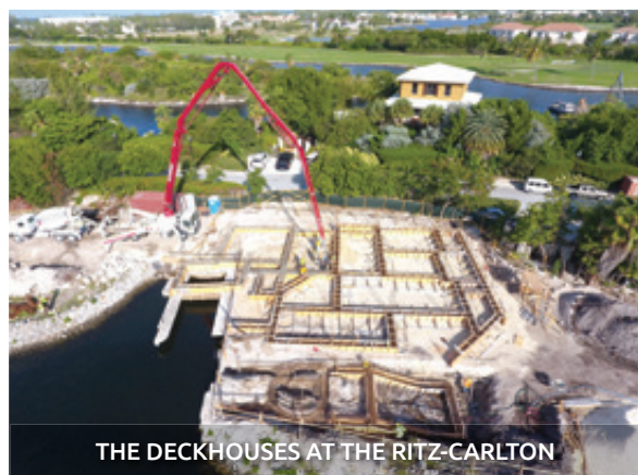
THE DECKHOUSES AT THE RITZ-CARLTON