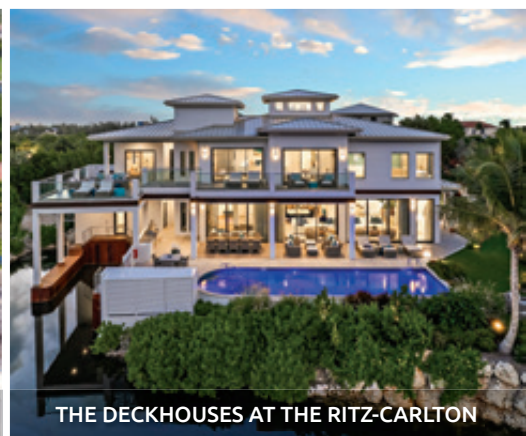
THE DECKHOUSES AT THE RITZ-CARLTON